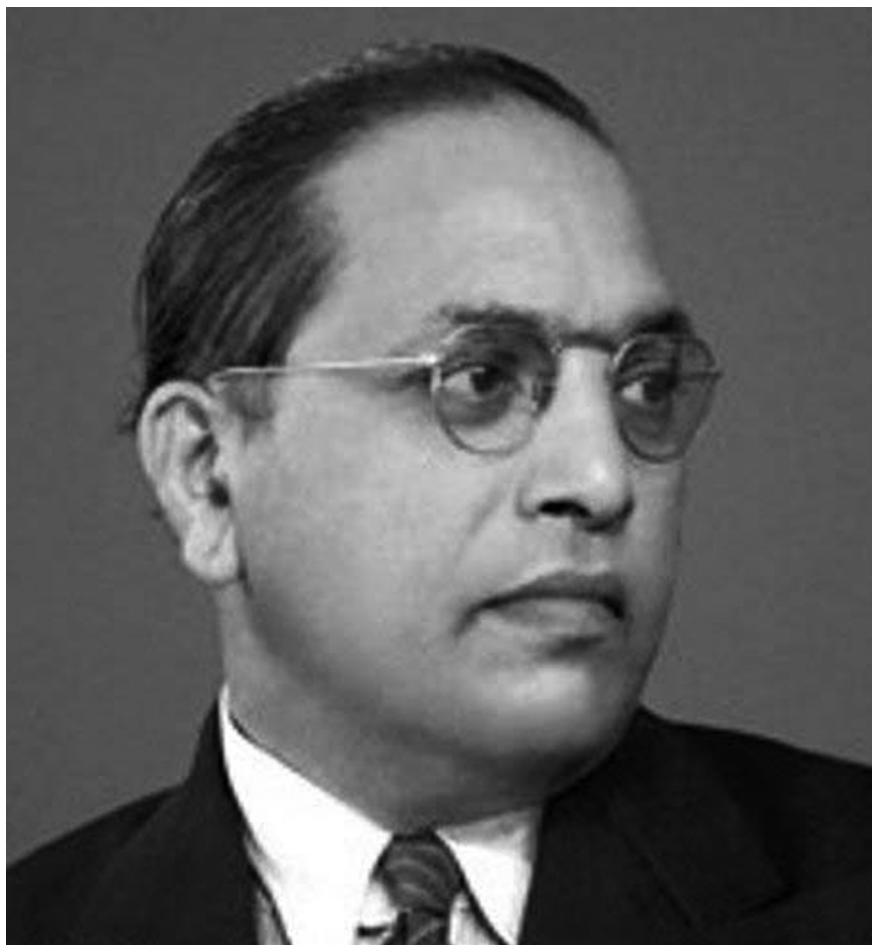
Babasaheb Dr. B.R. Ambedkar (14th April 1891 - 6th December 1956)