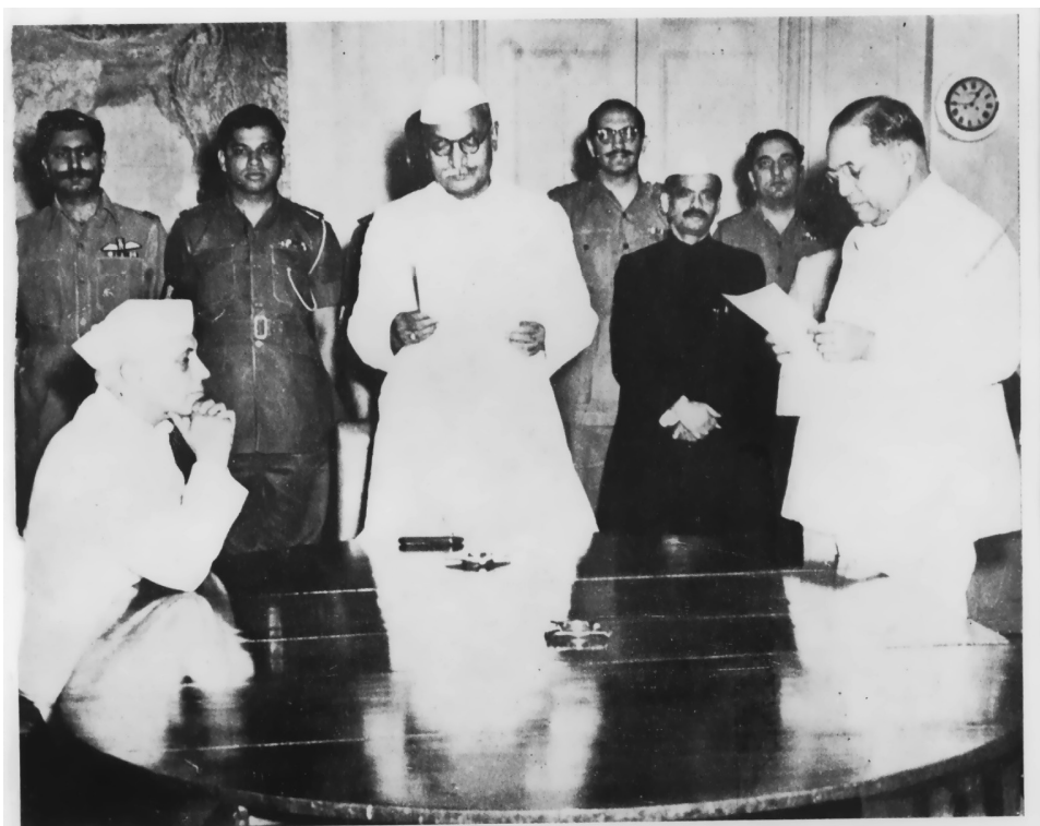
Dr. AMBEDKAR being sworn-in as the First Law Minister of Free India by the President Dr. RAJENDRA PRASAD